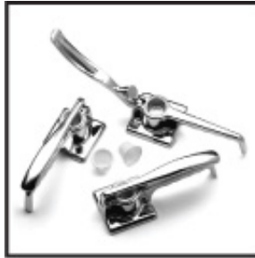
The Original Pill Crusher