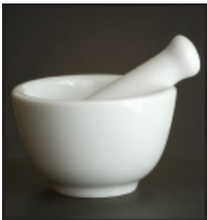
Mortar & Pestle