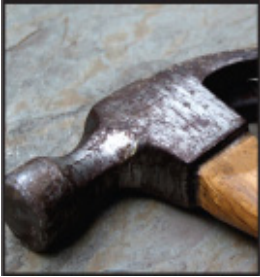
Hammer/ Stapler & Pliers

The most advanced technical solution for pill crushing and medication delivery